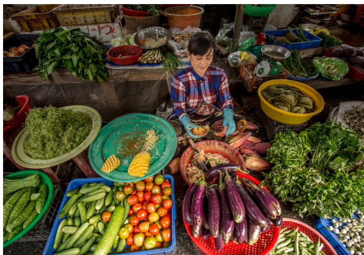
Browse through local markets