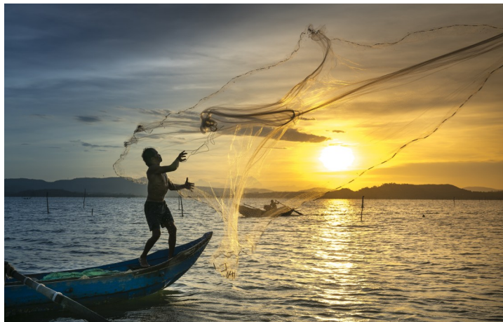
See life unfold along the Mekong River

Relax with morning Tai Chi or a coffee on deck as we cruise to Peam Chi Korng, where a tuk tuk ride brings us to