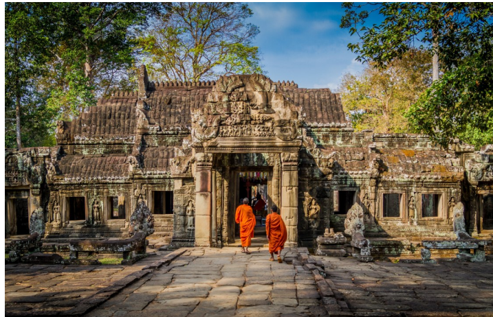
Explore the Ancient Temples of Angkor