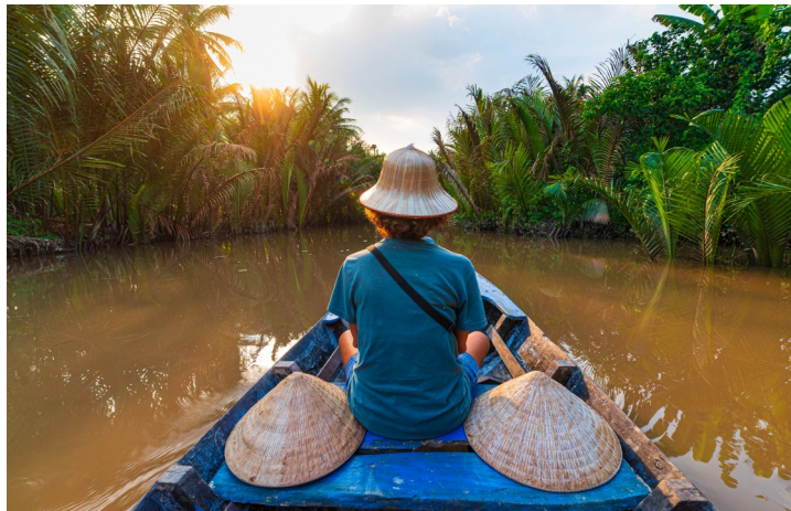
Journey by sampan through the canals of Ben Tre