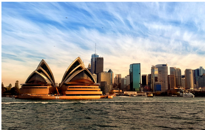
The Sydney Opera House—an architectural masterpiece on the harbour