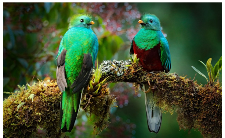
Encounter the Resplendent quetzal in the wild