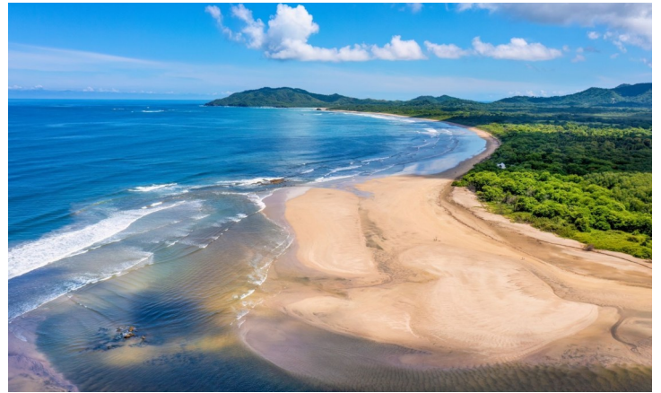
Tamarindo Beach, on the sun-drenched Pacific coast of Costa Rica