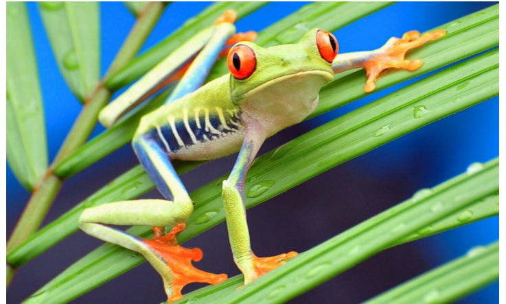
Tiny guardian of the jungle