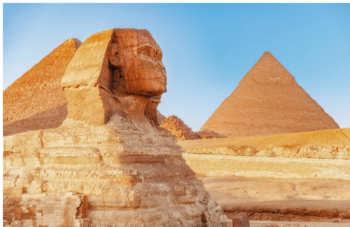
The Sphinx next to the Pyramids in the sands of Giza desert.