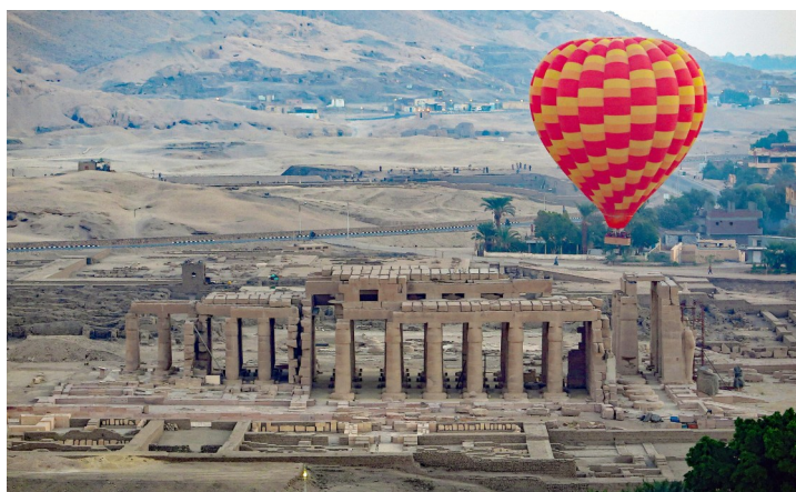
Take an optional hot air balloon ride over Luxor.