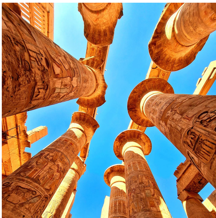
The towering columns of Karnak Temple.