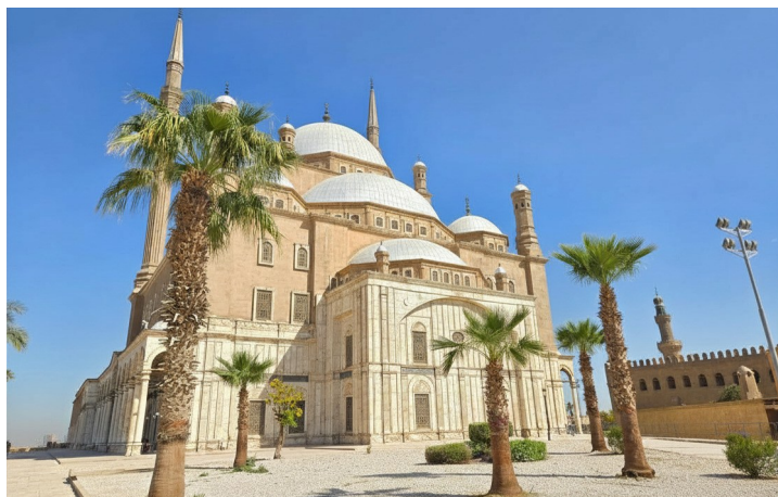
The grand courtyard of the Alabaster Mosque.

Early risers may enjoy an optional dawn hot air balloon flight before we venture into the hidden necropolis of the Valley of the Kings. Descending into the magnificent Tomb of Seti I, we encounter exceptionally preserved, vibrant wall reliefs detailing the afterlife. We then admire the terraced Temple of Hatshepsut, an architectural triumph carved directly into limestone cliffs for a legendary female pharaoh. After pausing beside the Colossi of Memnon, massive stone sentinels guarding a lost sanctuary, our riverboat gracefully navigates the Esna locks onward to Edfu. BLD