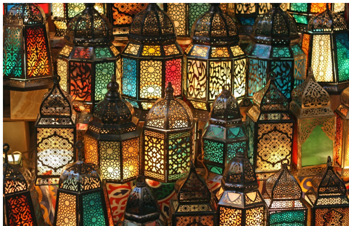
Browse the colourful shops of Khan El Khalili bazaar.