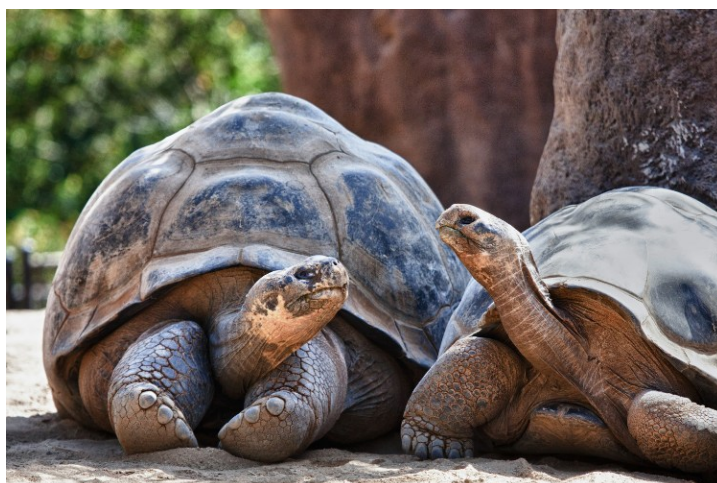
The islands' most famous resident, the giant Galapagos tortoise