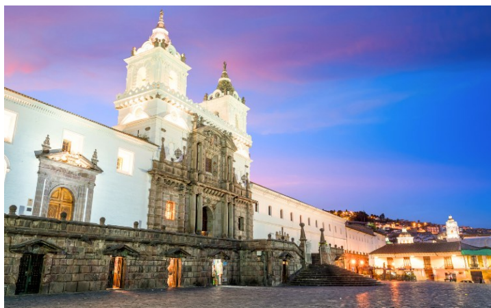
San Francisco Plaza: A colonial treasure in the heart of historic Quito

Bartolome Island is the archipelago's most photographed area. A climb up a wooden staircase rewards us with a stunning panorama of volcanic cones. After the trek, we set off on a panga ride around the majestic Pinnacle Rock in search of Galapagos penguins. In the afternoon, we land at Sullivan Bay on Santiago Island to witness the island's geological birth. The otherworldly lava fields contrast beautifully with the pristine white coral sand beach where we enjoy a refreshing swim. BLD