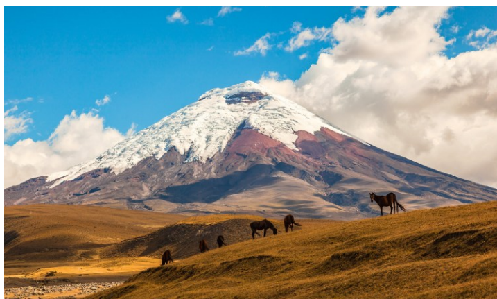
The snow-capped cone of Cotopaxi Volcano