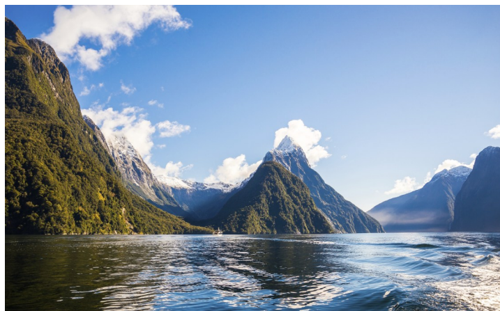
The stunning dramatic cliffs of Milford Sound