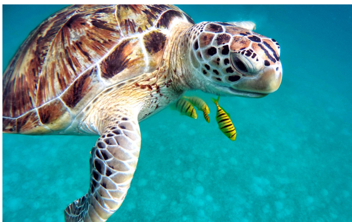
A turtle in the Great Barrier Reef

FEB 20, Saturday ROTORUA This morning, head to the Agrodome to learn about sheep breeds, watch live shearing and skilled farm dogs in action. Then, stop by the National Kiwi Hatchery to learn about New Zealand's national bird and the efforts to protect it.