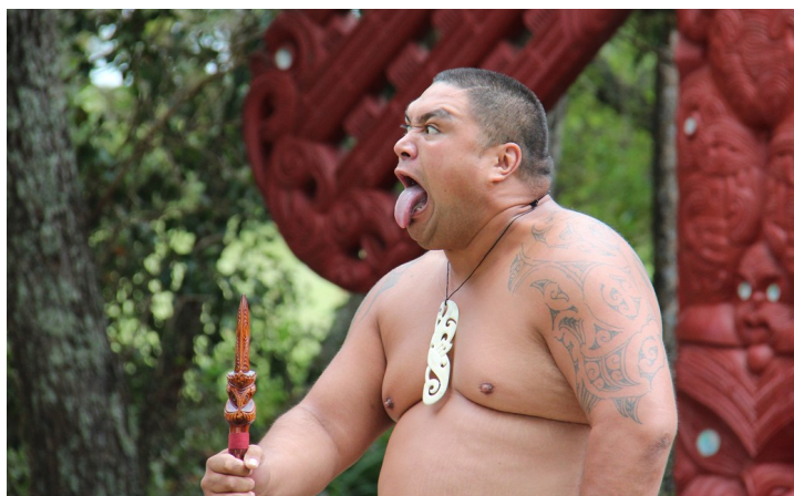
Discover the Maori culture of New Zealand

Fly to Ayers Rock (Uluru), in the heart of the Outback, a site of spiritual significance to the Anangu people. Drive through Kata Tjuta National Park for views of Uluru with a