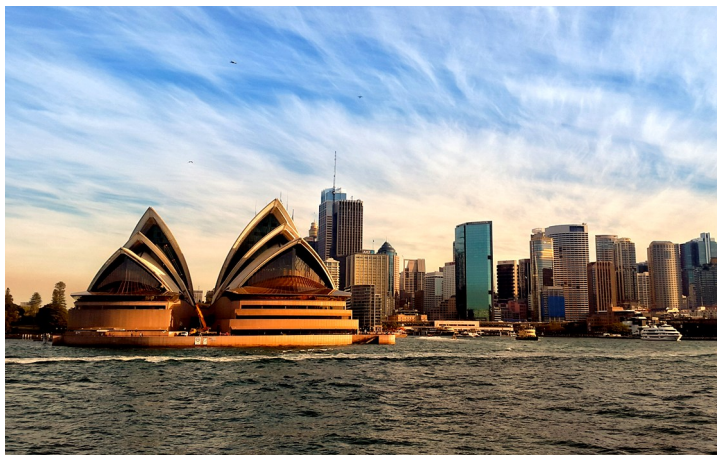
The Sydney Opera House—an architectural masterpiece on the harbour