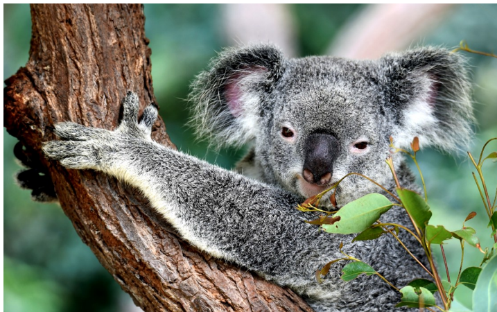
Koala, Australia's adorable tree-dwelling marsupial