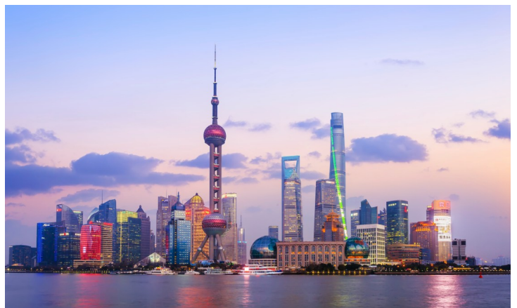
Shanghai's iconic skyline