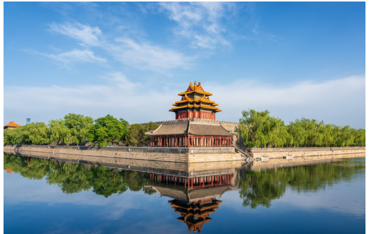
Discover the Forbidden City