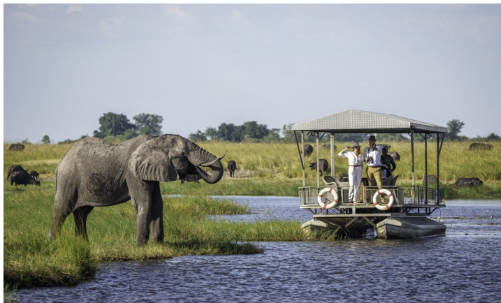
Spot wildlife while on safari.