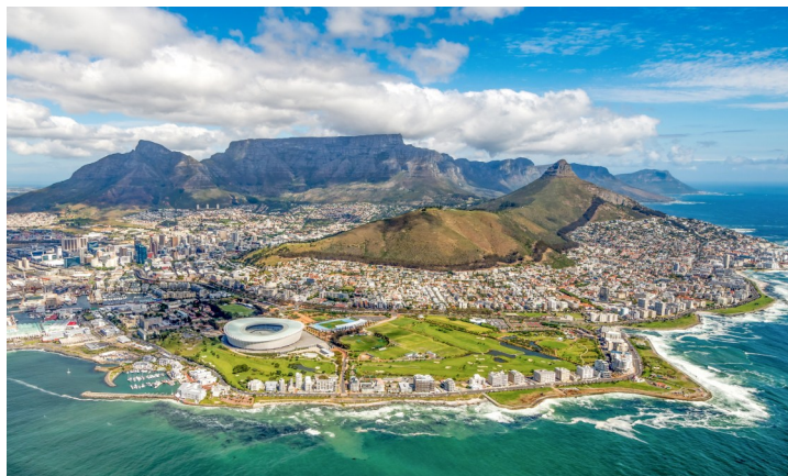
Aerial views of Cape Town