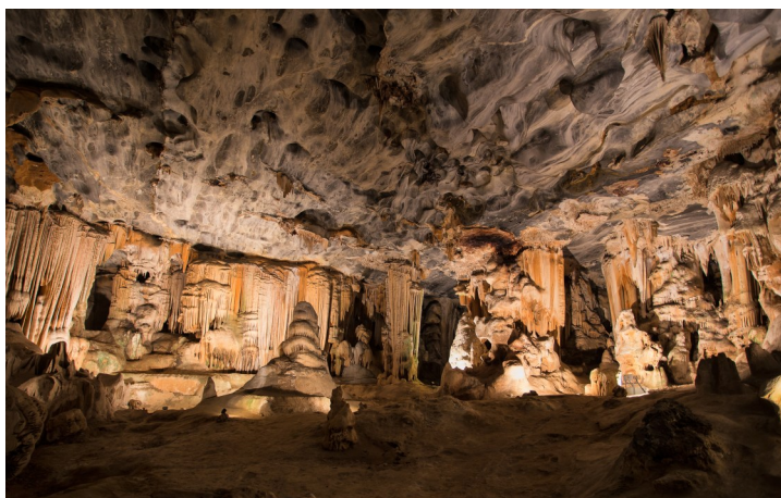
Explore Cango Caves