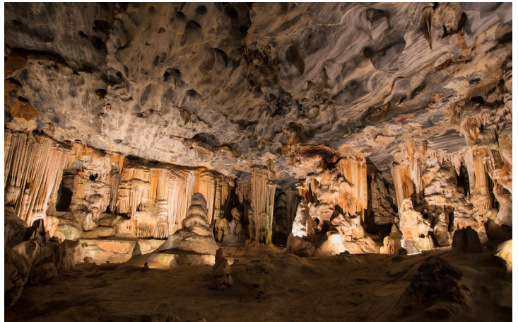
Explore Cango Caves