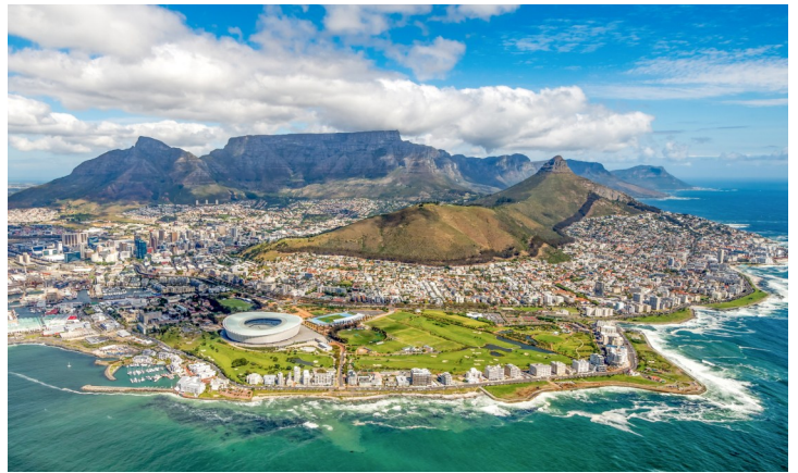
Aerial views of Cape Town