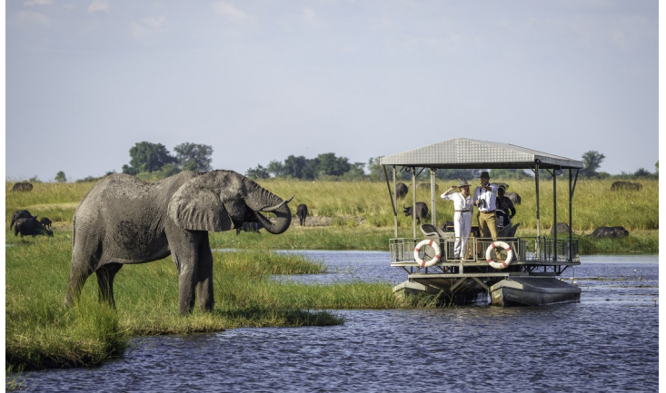
Spot wildlife while on safari.