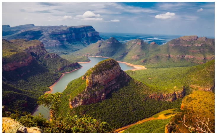
Blyde River Canyon, the world's largest green canyon