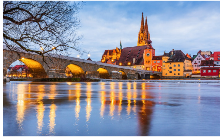
Medieval Regensburg glowing at dusk

Our festive journey begins as we touch down in Vienna, a city renowned for its imperial grandeur and vibrant coffee house culture. We are warmly greeted by our airport host and transferred to the pier to drop off our luggage. Before checking in, we seize the opportunity to step out into the crisp air to explore the city independently. Once our cabins are ready in the afternoon, we settle aboard our AMADEUS ship. The evening brings us together in the Panorama Bar for a Welcome Cocktail with the Cruise Director, followed by a celebratory Welcome Dinner. We remain docked in Vienna overnight, surrounded by the twinkling lights of the holiday season. AMADEUS Queen (6 nights) D