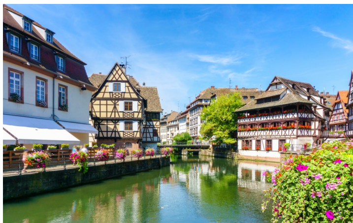
Petite France, Strasbourg