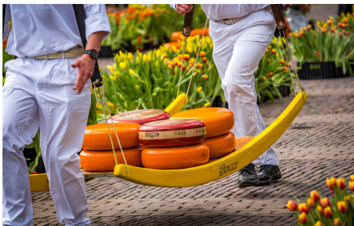
The traditional cheese market in Alkmaar, Netherlands