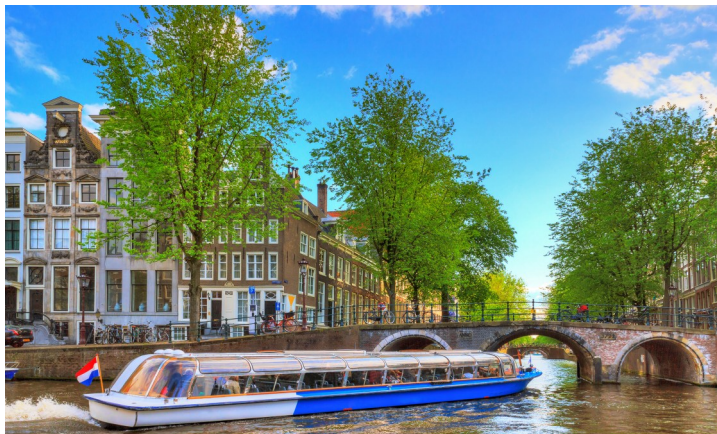
Wonderful canals in Amsterdam, Netherlands