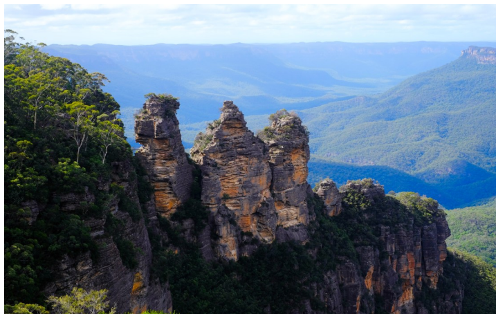
Rising above the Jamison Valley, the Three Sisters stand watch