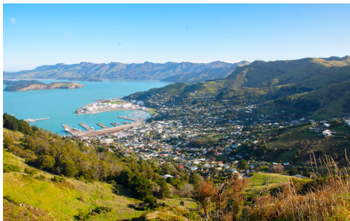
Christchurch: the South Island's largest city

NOV 21, Saturday MELBOURNE / AYERS ROCK Fly to Ayers Rock (Uluru), in the heart of the Outback, a site of spiritual significance to the local Anangu people. Drive through Kata Tjuta National Park for views of Uluru with a stop at the Olgas, a striking formation of domed red