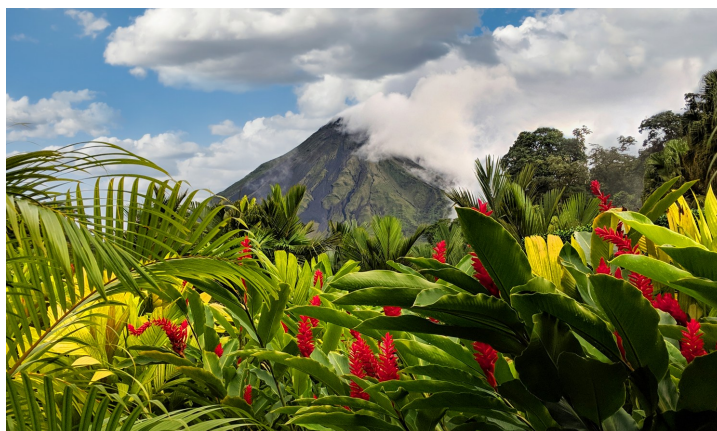
Arenal Volcano rising above Costa Rica rainforest