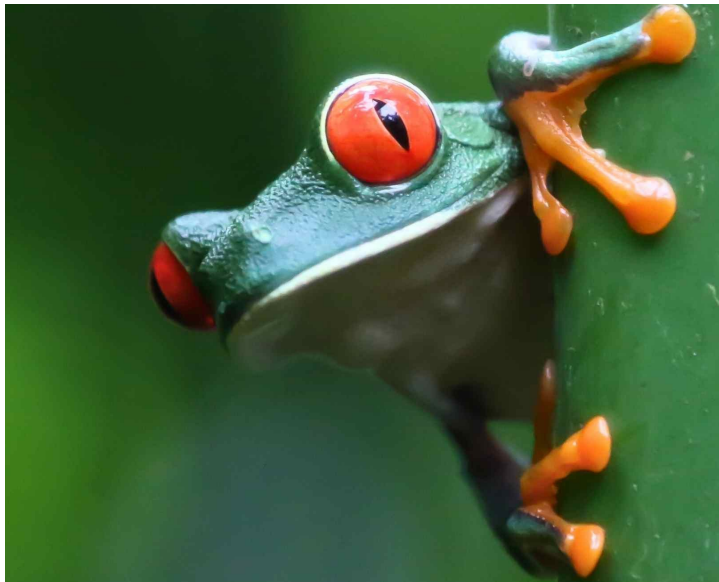
Tiny guardian of the jungle