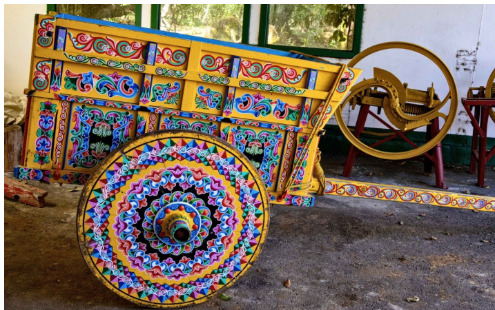
Traditional hand-painted Costa Rican oxcart (Carreta)