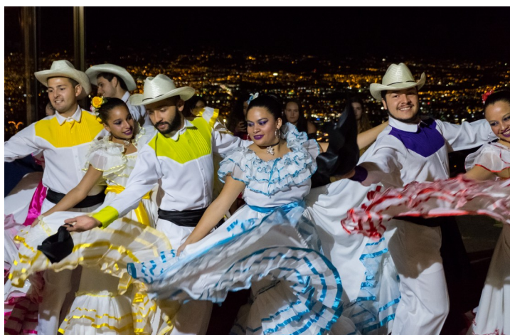
Enjoy dinner and a folklore show set against the glow of the city.