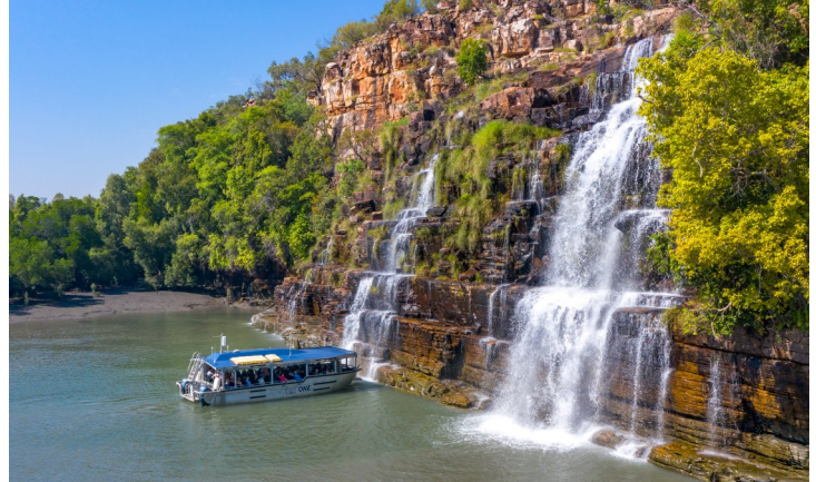
King Cascade.