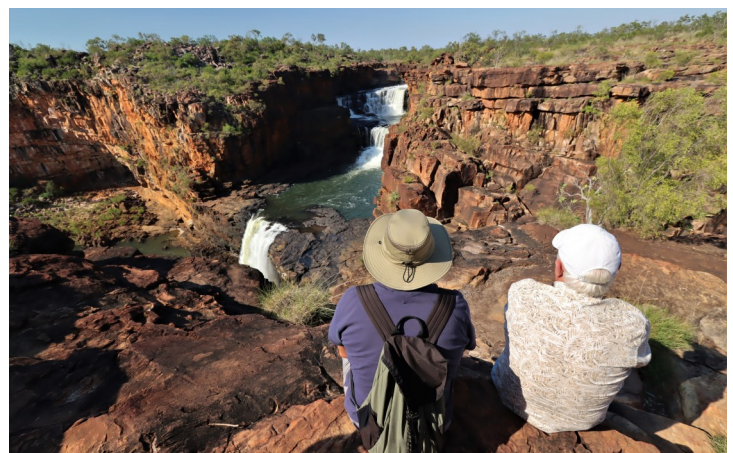
Mitchell Falls.