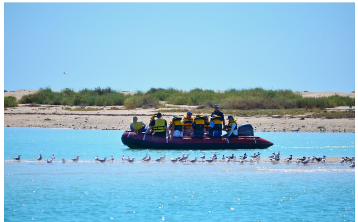
Lacepede Island.