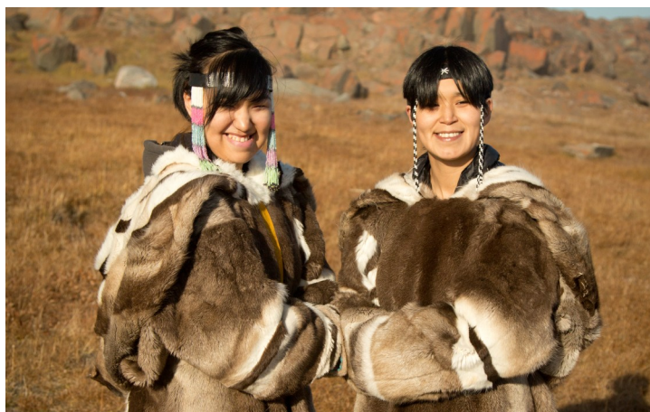
Local Inuit culture in the High Arctic.

At the top of Baffin Island lies Tallurutiup-Imanga (also known as Lancaster Sound), a true Arctic oasis. This channel and the surrounding lands are rich in wildlife and history — both Indigenous and European — and offer rewarding hiking opportunities. At Dundas Harbour on Devon Island, we'll visit an abandoned RCMP outpost. At Croker Bay, we plan to cruise close enough to appreciate the splendour of glacial textures and calving ice while maintaining a safe distance. We then go ashore at windswept Beechey Island, home to the Beechey Island National Historic Site. Maintained by Parks Canada, these sites tell the story of Sir John Franklin's ill-fated 1845–46 expedition to explore the Northwest Passage. What happened to Franklin and his crew remains an enduring chapter in Arctic exploration history. We also hope to explore the shores of uninhabited Prince Leopold Island, a significant migratory bird sanctuary and Important Bird Area, where we aim to launch Zodiacs for an immersive cruise at the foot of the bird cliffs. Nearby, on the northeast tip of Somerset Island, lies Port Leopold, an abandoned Hudson's Bay Company trading post dating back to 1937, where remnants of the original store and manager's house can still be seen. BLD