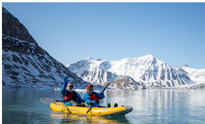
Kayak in the Arctic (additional cost).