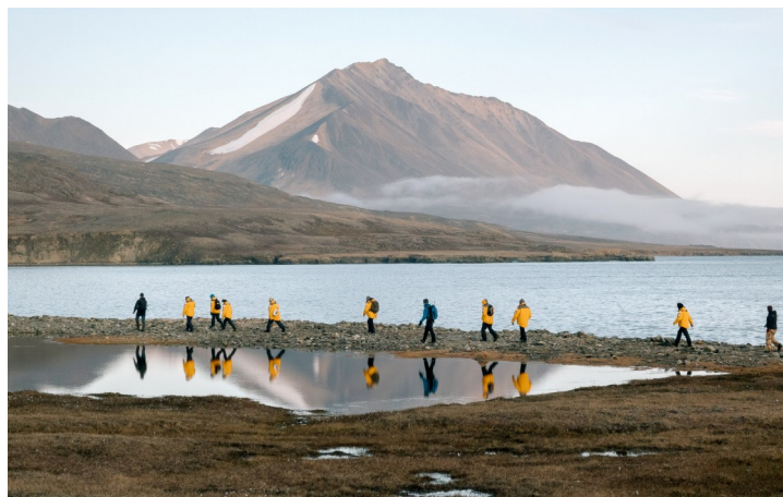
Explore vast tundra landscapes.