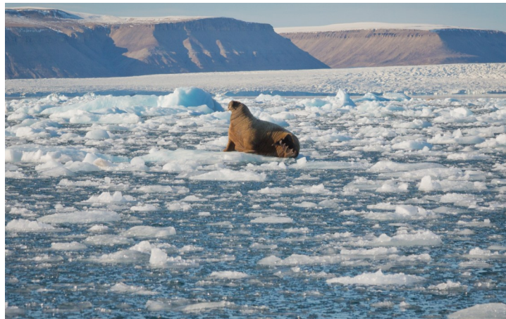
Watch for iconic Arctic wildlife.