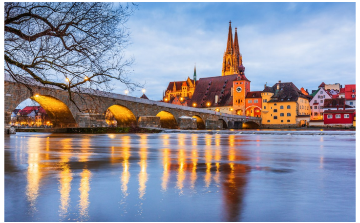
Medieval Regensburg glowing at dusk

Our festive journey begins as we touch down in Vienna, a city renowned for its imperial grandeur and vibrant coffee house culture. We are warmly greeted by our airport host and transferred to the pier to drop off our luggage. Before checking in, we seize the opportunity to step out into the crisp air to explore the city independently. Once our cabins are ready in the afternoon, we settle aboard our AMADEUS ship. The evening brings us together in the Panorama Bar for a Welcome Cocktail with the Cruise Director, followed by a celebratory Welcome Dinner. We remain docked in Vienna overnight, surrounded by the twinkling lights of the holiday season. AMADEUS Queen (6 nights) D