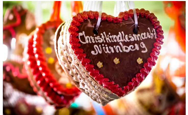
Browse rows of festive stalls filled with traditional sweets and ornaments

We awake this morning in the stunning Wachau Valley, a UNESCO World Heritage region where steep terraced vineyards meet the winding Danube. Our destination is the imposing Melk Abbey, a golden-hued Baroque masterpiece that has stood as a spiritual centre for over 900 years. On a guided tour of this Benedictine treasure, we marvel at the Marble Hall and the famed library, home to thousands of medieval manuscripts and exquisite frescoes by Paul Troger. Upon returning to the ship, we celebrate the season with a warming mug of traditional glühwein. As we cast off for Passau, the rest of the day offers a perfect opportunity to relax on board, taking in the serene beauty of the winter countryside drifting past our windows. BLD