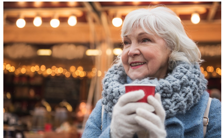
Warm up with a mug of traditional glühwein

This morning, our panoramic drive takes us along the magnificent Ringstrasse, a circular boulevard built to replace the old city walls and lined with architectural masterpieces. We admire the State Opera House, the Parliament, the Burgtheater, and the imposing City Hall, which serves as a stunning backdrop for the city's most famous "Christkindlmarkt." Then, we embark on a guided walking tour through the historic centre. We wander past the Hofburg Imperial Palace, the winter residence of the Habsburgs, and stroll along the elegant Kohlmarkt before arriving at the iconic St. Stephen's Cathedral with its distinctive tiled roof. Before returning to our ship, there is time to walk through the pedestrian zone at our own pace. The afternoon is ours to enjoy the festive atmosphere of the traditional Christmas markets independently. BLD