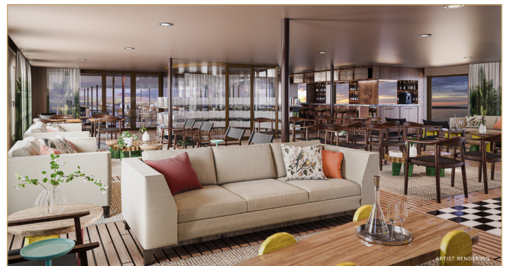
Main Lounge, artist rendering

Take in the splendor of the Magdalena River within the unparalleled comfort of the stunning AmaMelodia . Delight in spectacular views from the twin balconies (French balcony and outside balcony) within your spacious stateroom, where accommodations range from 237 sq. ft. to 306 sq. ft. in our luxury suites. Each stateroom will also include a safe, mini-fridge, separate sitting area, desk, bathroom with shower, and individually controlled air conditioning.