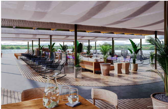
Sun Deck, artist rendering

Cruise in luxury along Colombia's magnificent Magdalena River on board our stunning newly designed AmaMelodia , an intimate 64-passenger ship designed to maximize your views along this special waterway. Taste exquisite, locally inspired Latin American cuisine and Western favorites within the Main Restaurant, indulge in an intimate specialty dining experience and enjoy live music and more each evening within the Main Lounge. For the ultimate in relaxation, take a dip in the sun-deck pool and watch the views go by.