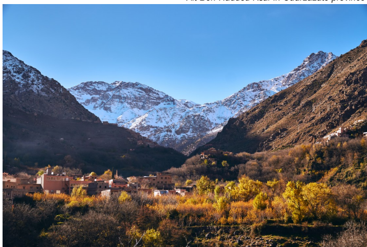
High Atlas mountains with Jebel Toubkal mountain