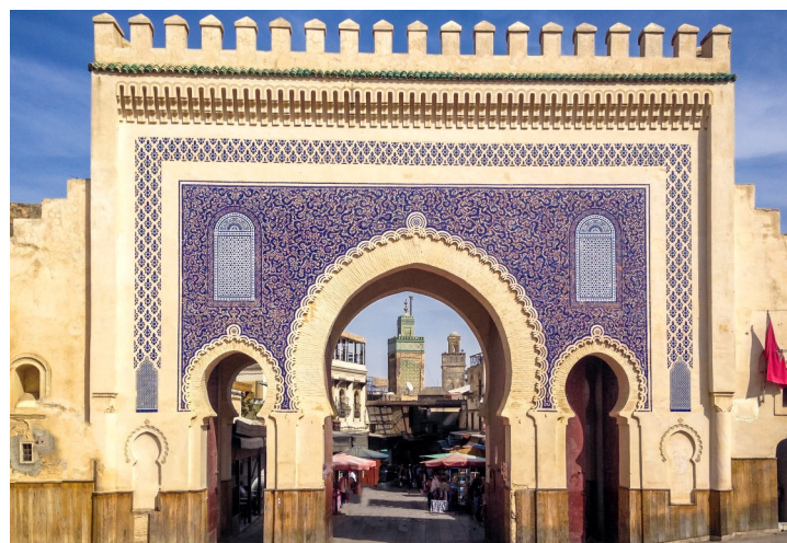
Bab Bou Jeloud gate (Blue Gate) - Fez, Morocco