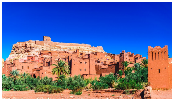
Ait-Ben-Haddou Ksar in Ouarzazate province