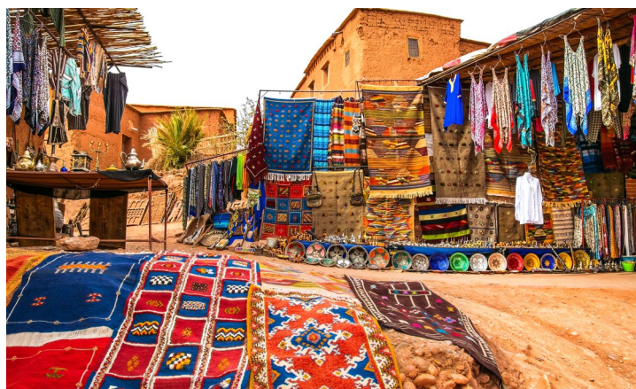
Souvenir shop in the open air in Kasbah