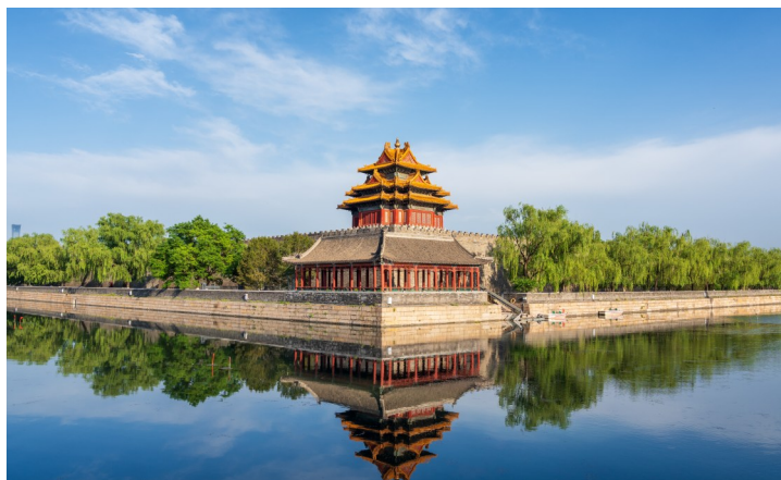
Discover the Forbidden City