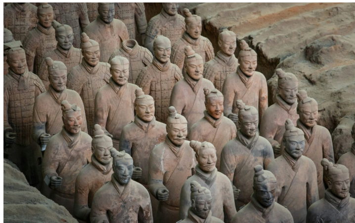
See the impressive Terracotta Warriors