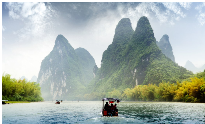
Cruise past the dramatic karst peaks of the Li River

This morning, we explore Daxu, an ancient town where history lingers in cobbled streets, stone bridges, and traditional houses. We'll also have the chance to visit a local family to learn about their daily lives. In the afternoon, we continue to the Reed Flute Cave, admired for its colourful stalactites and stalagmites, before visiting Elephant Trunk Hill, the symbol of Guilin, and ending the day at a lively local market. BLD