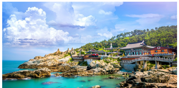
Haedong Yonggungsa Temple in Busan, South Korea

Memorial Park, two moving sites that offer deep insights into the events that shaped the city. Later, we'll explore Glover Garden, an open-air museum with beautifully preserved 19th-century Western-style buildings, picturesque grounds, and panoramic harbour views. BLD