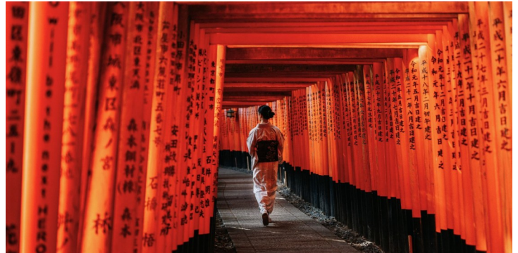
Visit Fushimi Inari Shrine, voted a top must-see spot in Japan