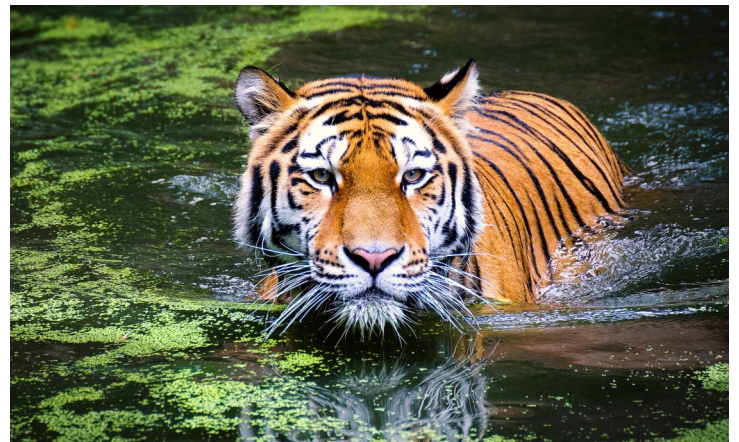
Search for the majestic Bengal tiger in Manas National Park

Site. Elephant Ride / Jeep Safari: Begin early with a thrilling elephant ride at sunrise. After, enjoy breakfast with Indian specialties like dosas (thin savoury crepes), idlis (rice cakes), poori aloo (potato curry with crisp fried bread), and parathas (flatbread). Then, embark on two jeep safaris exploring the Central and Western Ranges, with lunch. Jeep Safari at Eastern & Central Range: Opt for a full-day jeep safari through the Eastern and Central Ranges, including lunch. Return to our riverboat, passing through the scenic paddy fields of the Karbi Anglong people. BLD