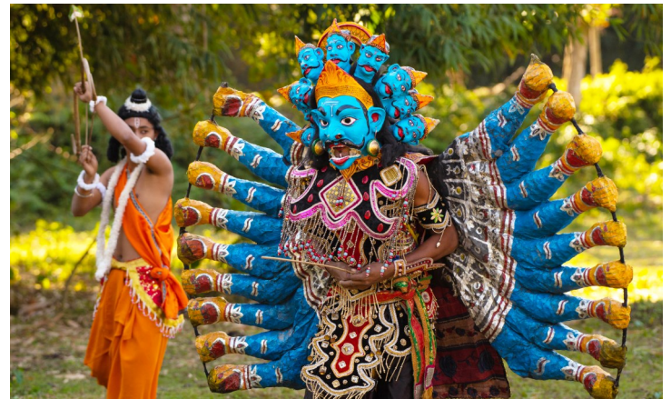
Experience vibrant traditional dances in Majuli, the world's largest river island