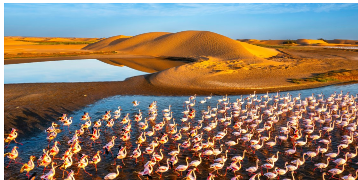
Flamingos in Walvis Bay, Namibia