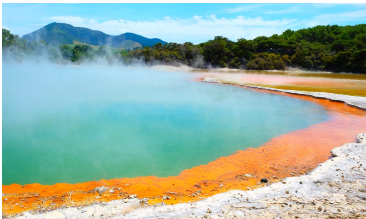
Steaming vents and mineral-rich pools shape Rotorua's volcanic landscape