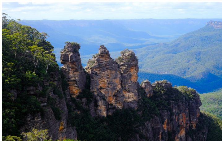
Rising above the Jamison Valley, the Three Sisters stand watch