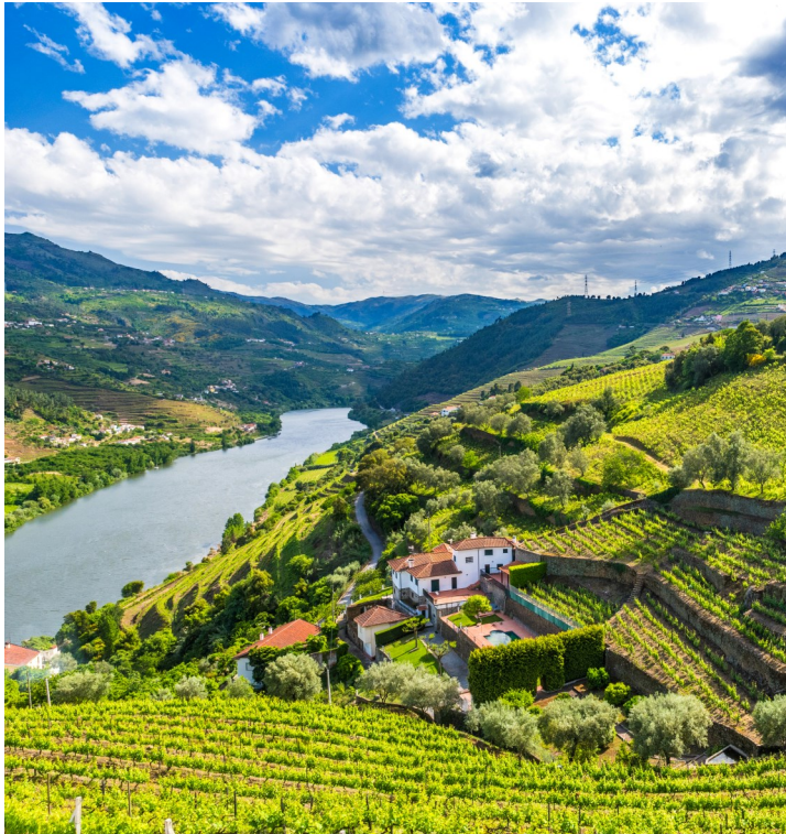
Enjoy gorgeous views along the Douro River

Our journey draws to a close as we transfer to the airport and catch our flight(s) bound for Canada and home. B