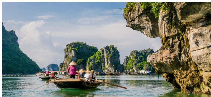
Cruise amongst UNESCO World Heritage Site Ha Long Bay