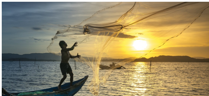
Fishermen on the banks of the Mekong River

This morning we are in Phnom Penh, the capital of