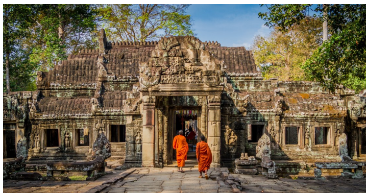
Buddhist monks at Angkor Wat

Cambodia, famous for its French colonial architecture, busy cafes, vibrant nightlife and renovated river "corniche." Our morning visit will be by private cyclo, a style of transport unique to the Orient which provides an excellent way to experience the hustle and bustle of the city. Visit the Royal Palace, the spectacular Silver Pagoda and the National Museum displaying Khmer crafts. After lunch, we visit the Killing Fields and Genocide Museum. We will spend the night in port. BLD