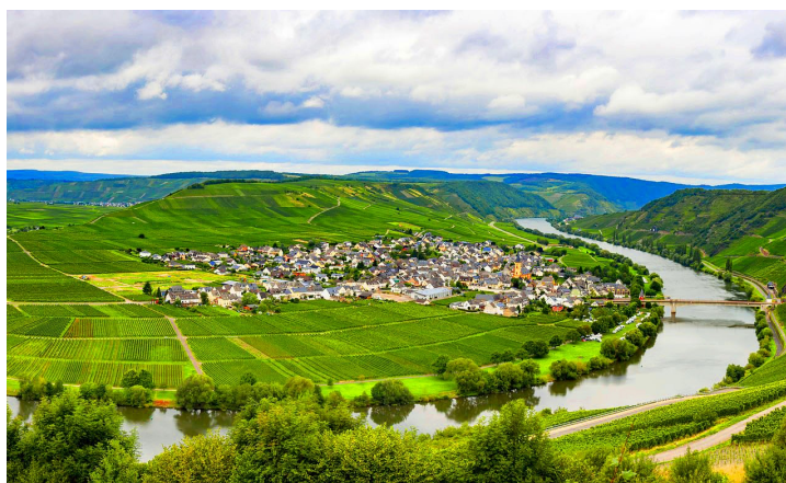
The Moselle River