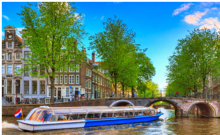
The canals of Amsterdam, Netherlands