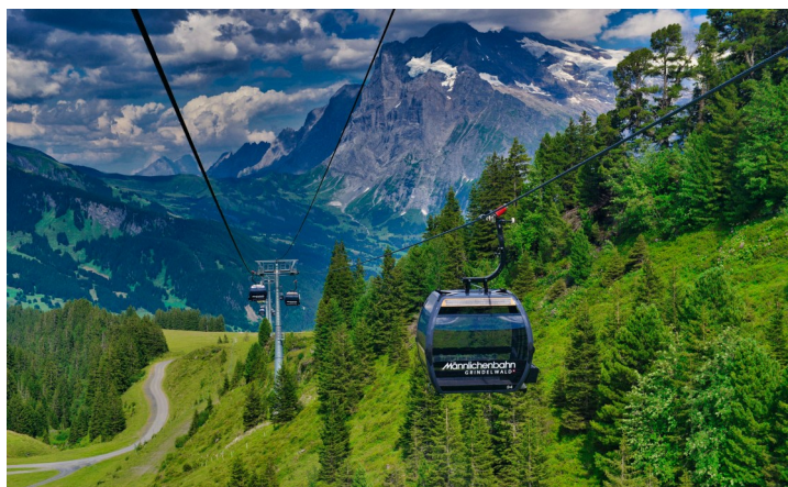
Take a cable car ride up to Grindelwald