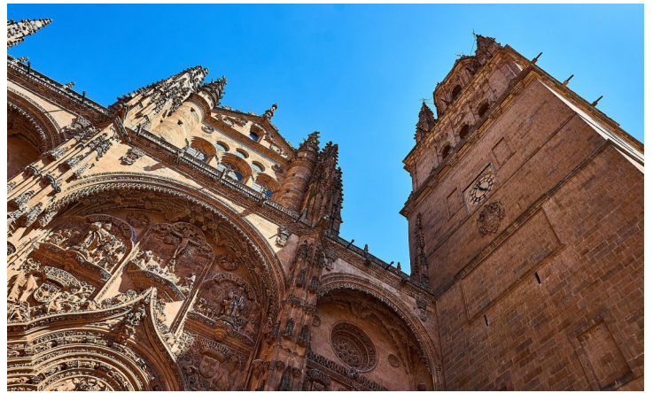
Tour Salamanca, Spain

MAY 15, Friday PORTO Today we are back in the vibrant city of Porto at the mouth of the Douro river. Famous for its export of Port wines, it's easy to imagine how British merchant ships would have once clustered together in the medieval harbour, waiting to take their produce across the water. Our city tour will touch on the fortified structures of Castelo da Foz and Castelo do Queijo. Those willing can join a walking tour through town to get closer to the vibrant daily lives of the locals. BLD