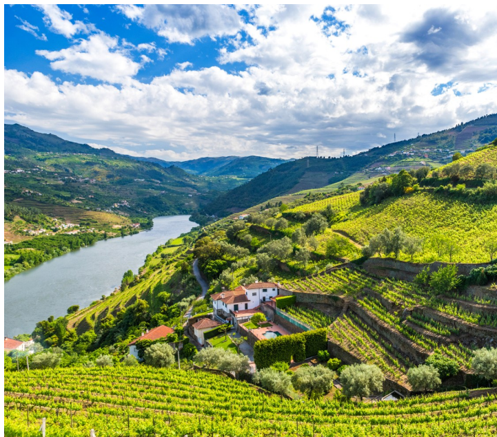
Enjoy gorgeous views along the Douro River

Enjoy the Best Available Pricing for a limited time! Prices are set to increase by up to $1000 per person as of July 4, 2025