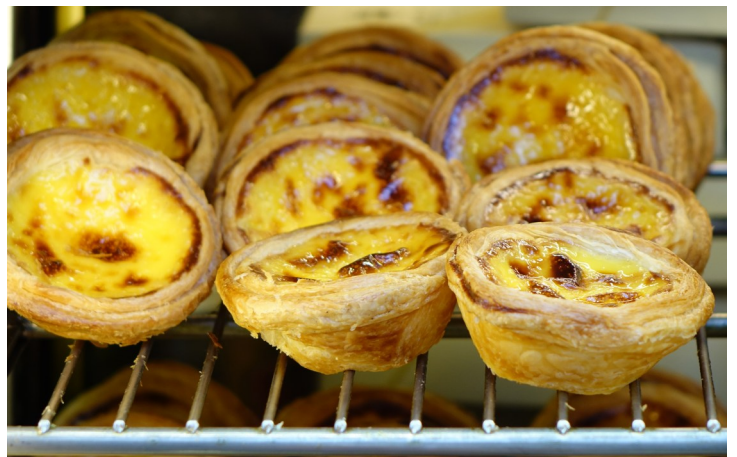
"Pastéis de Nata" Portuguese custard tarts