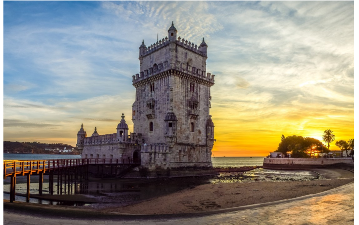
Belem Tower, Lisbon