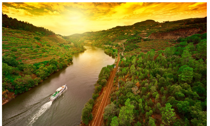
Enjoy the beautiful views of the Douro River Valley