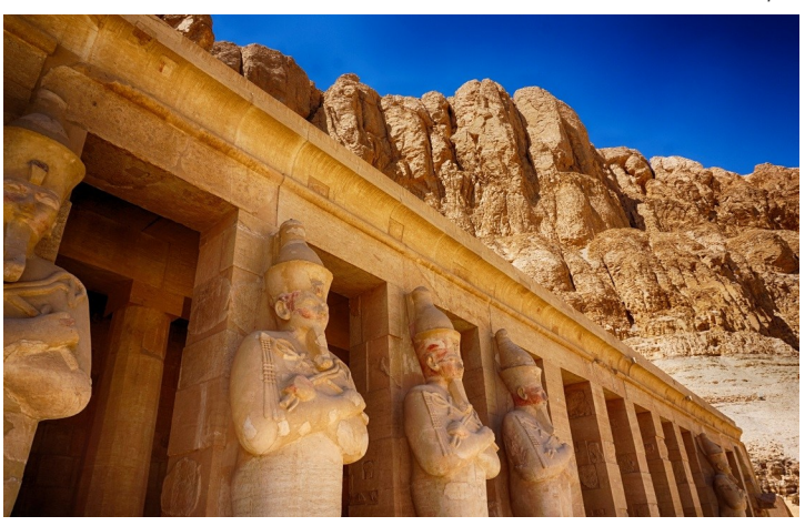
Temple of Hatshepsut