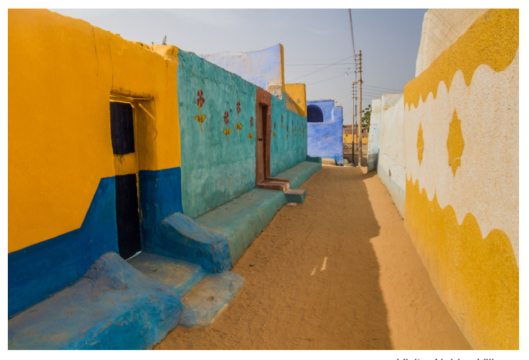
Visit a Nubian Village