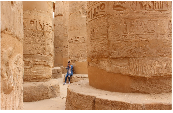
Marvel at the columns at the Karnak Temple

Cruise to Elephantine Island to experience Nubian culture and learn about local life, history, and traditions. After a guided walk through the community, stop at a school to join a lively class and interact with students. Later, sail to Kom Ombo to explore the well-preserved Roman-style Temple of Sobek, watched over by two black granite statues of