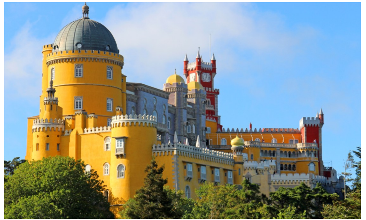
The Pena National Palace, Sintra

MAY 15, Friday PORTO Today we are back in the vibrant city of Porto at the mouth of the Douro river. Famous for its export of Port wines, it's easy to imagine how British merchant ships would have once clustered together in the medieval harbour, waiting to take their produce across the water. Our city tour will touch on the fortified structures of Castelo da Foz and Castelo do Queijo. Those willing can join a walking tour through town to get closer to the vibrant daily lives of the locals. BLD