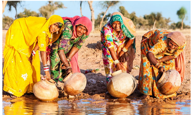
Experience the way of life of the Thar Desert