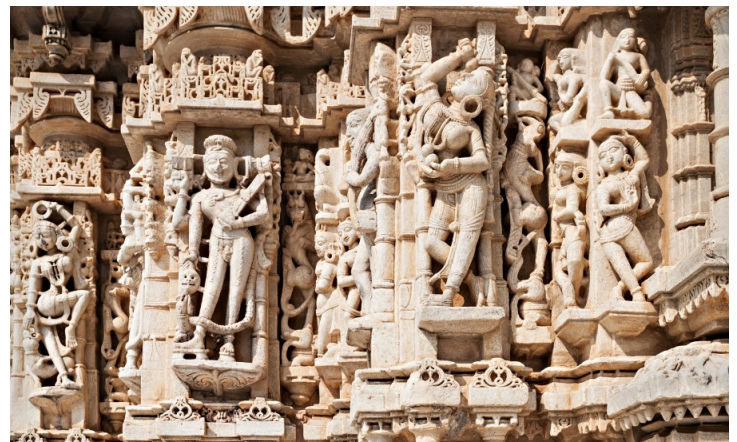
The intricately hand-carved marble pillars of Ranakpur Temple