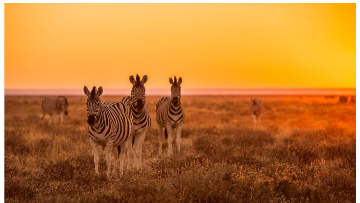
Zebra's grazing in Etosha Park, Namibia

This morning, explore some of Africa's finest prehistoric rock art at Twyfelfontein, featuring paintings and engravings dating back 5,000 years. This treasure trove, left by Stone Age artists, is one of the richest collections in Africa. Our journey through this stunning landscape includes opportunities to stretch our legs, examine interesting stones, plants, bugs, and other creatures, and photograph the amazing scenery. Visit the Organ Pipes, a mass of basalt slabs in a ravine carved by a river; Burnt Mountain, a small inselberg and national monument since 1956; and the Petrified Forest, with enormous fossilized tree trunks and welwitschia plants, reputed to live over 1,000 years. This afternoon, we'll search for desert elephant herds on an Aba-Huab River safari. BD