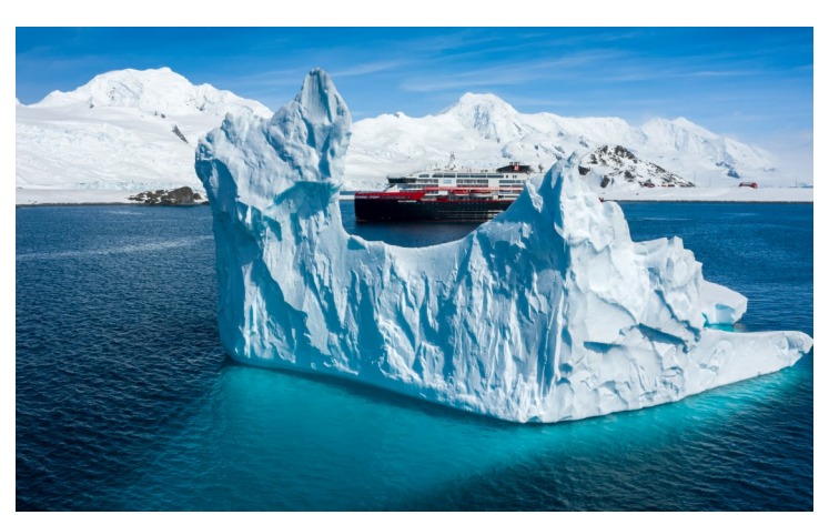
Welcome to Antarctica!