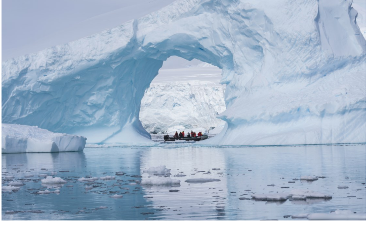
Exploring towering icebergs.