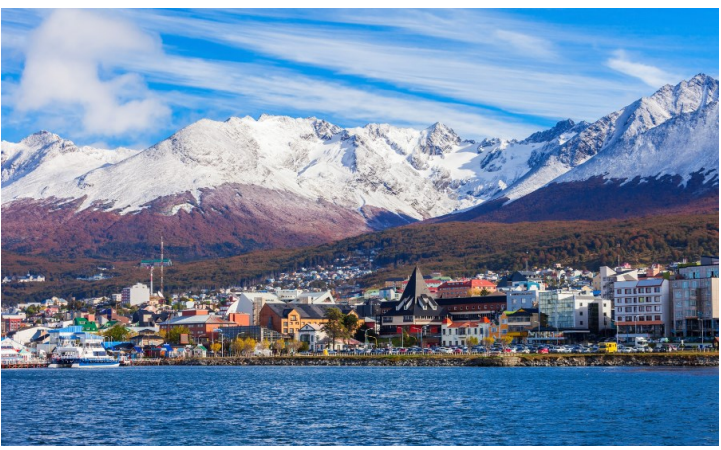
Stunning view of Ushuaia, the gateway to Antarctica

Our expedition cruise concludes in Ushuaia, followed by a flight back to Buenos Aires, often called the "Paris of South America" for its stunning architecture. This lively city is rich