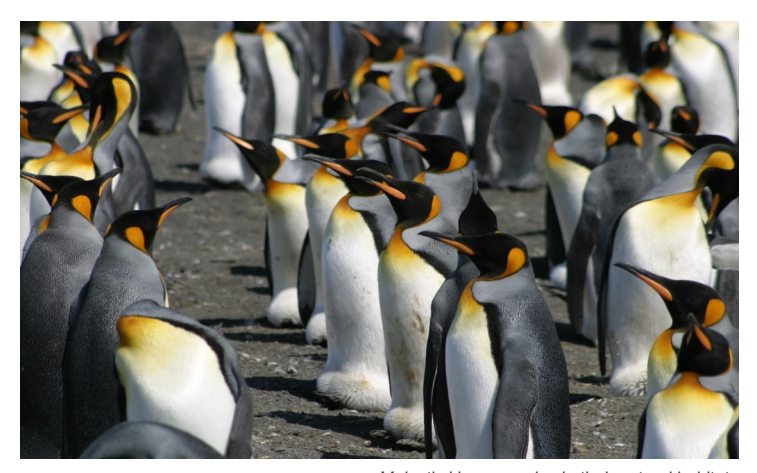
Majestic king penguins in their natural habitat