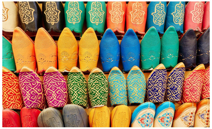
Vibrant Moroccan slippers, a colourful find amidst the bustling souks