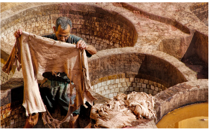
Fez's historic leather tannery: a timeless craft captured in the heart of Morocco

MAY 8, Thursday DADES VALLEY / OUARZAZATE Today, we travel through the Dades Valley, where the Dades River nourishes a variety of colourful fruit and nut trees and extraordinary red rock formations, to reach the stunning Dades Gorge. This area is often referred to as "Kasbah Country" due to the impressive forts that grace the