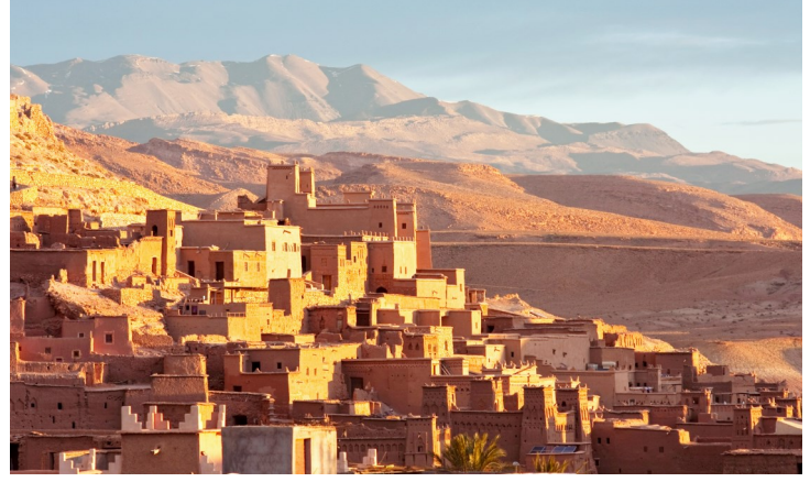
Aït-Ben-Haddou, a UNESCO World Heritage Site