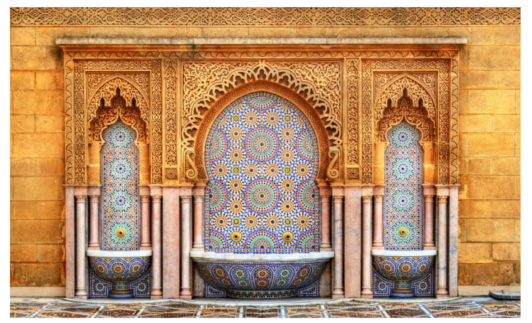
Exquisite Moroccan tiled fountains grace the cityscape of Rabat