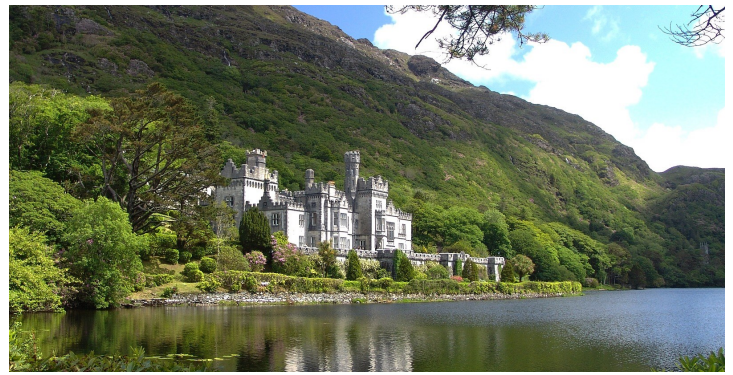
Kylemore Abbey, founded in 1920

Regretfully our Irish journey must draw to a close as we say farewell to our Irish friends and fly home to Canada. B