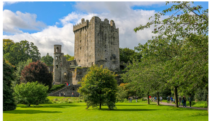
Earn the "gift of the gab" at the famous Blarney castle