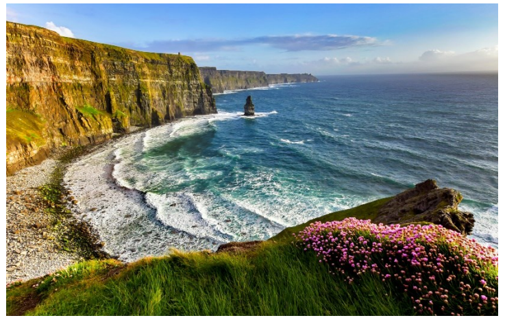
Cliffs of Moher, Ireland

Enjoy Ireland's most scenic drive today as we travel via Killorglin and Glenbeigh with views of Dingle Bay and onto the fishing village of Cahirciveen. As we reach the outer end of the Ring, we have views of the Atlantic and the