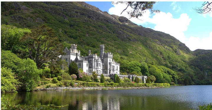
Kylemore Abbey, founded in 1920

CT Rating 3/5 - Moderately Challenging: This coach tour is designed as a leisurely, in-depth experience with two or three nights at most hotels. Members should be aware that the journey includes a number of longer walks, some over uneven terrain and with changes in elevation.