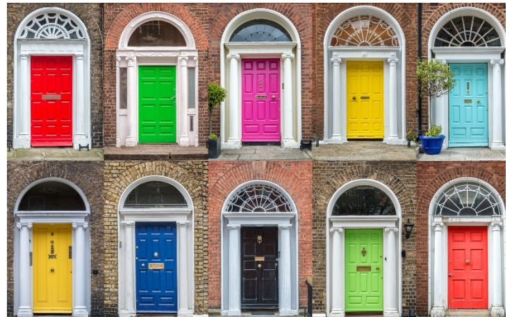
The colourful doors of Dublin