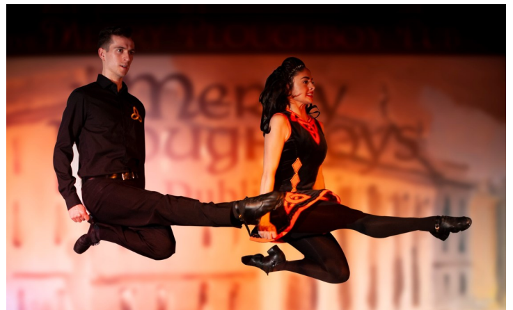
Enjoy traditional Irish entertainment at the Merry Ploughboy Pub