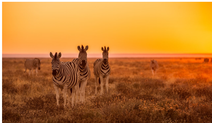
Zebra's grazing in Etosha Park, Namibia