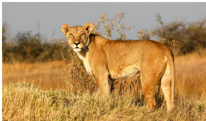
Namibia wildlife is stunning!

This morning, explore some of Africa's finest prehistoric rock art at Twyfelfontein, featuring paintings and engravings dating back 5,000 years. This treasure trove, left by Stone Age artists, is one of the richest collections in Africa. Our journey through this stunning landscape includes opportunities to stretch our legs, examine interesting stones, plants, bugs, and other creatures, and photograph the amazing scenery. Visit the Organ Pipes, a mass of basalt slabs in a ravine carved by a river; Burnt Mountain, a small inselberg and national monument since 1956; and the Petrified Forest, with enormous fossilized tree trunks and welwitschia plants, reputed to live over 1,000 years. This afternoon, we'll search for desert elephant herds on an Aba-Huab River safari. BD