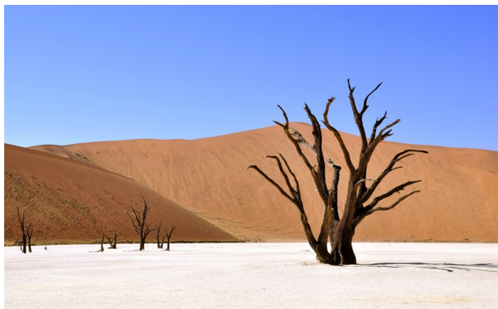
Sossusvlei sand dunes