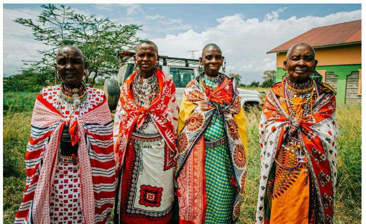
Maasai women adorned in vibrant, colorful garments