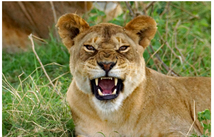
The King of East Africa's vast wilderness, captured by Craig Liddle.