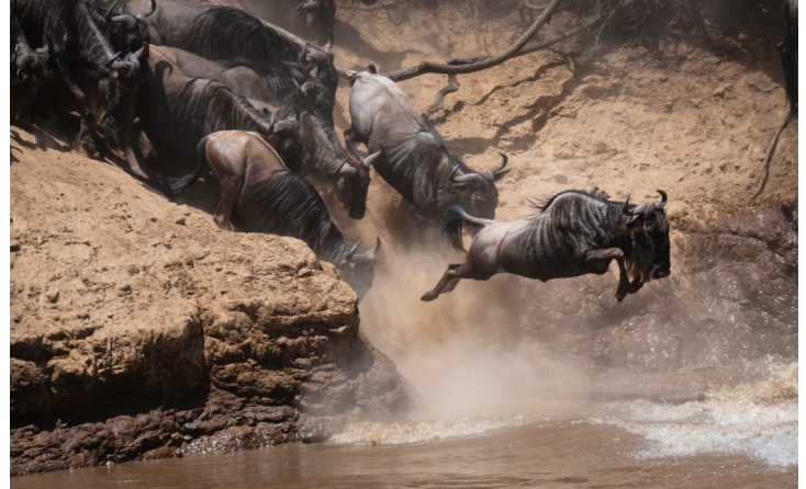
Wildebeest crossing the Mara River during the great migration