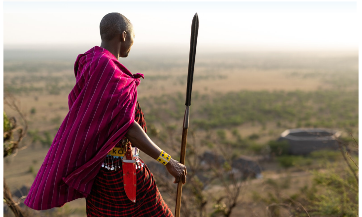
Overlooking the Kubu Kubu Tented Lodge, credit Tanganyika Wilderness Camps

A short flight brings you to Isibania, where we cross into Tanzania. Another flight takes us to the heart of the Serengeti, where we meet our new drivers/guides. Experience an afternoon game drive and unwind in a deluxe lodge overlooking the vast plains for the next three nights. Kubu Kubu Tented Lodge (3 nights) BLD