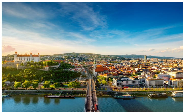
Bratislava's Old Town

Belgrade, the capital of Serbia, effortlessly blends Western influence with its rich cultural roots and history. We start our morning with a tour of Kalemegdan Fortress, where the