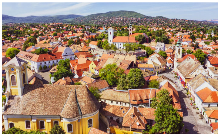
Aerial view of the charming village of Szentendre