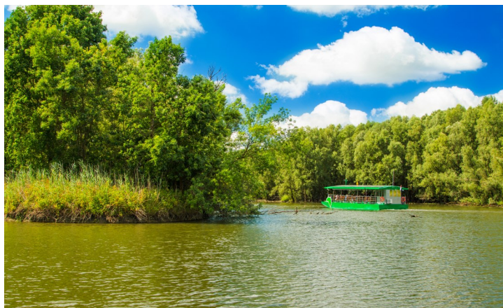
Explore the serene wetlands of Kopački Rit by boat