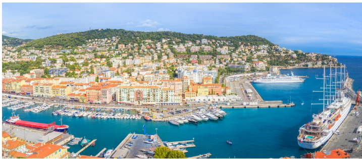
Port of Nice, France

Our journey is capped off with a night in Lyon, a chance to indulge in its culinary sensations. This unique itinerary will delight river cruisers and those who love to explore this delightful region.