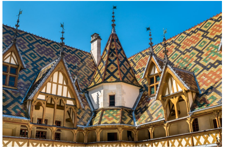
Architecture of the historic Hospices of Beaune, France

SEP 10, Wednesday TOURNON Wonder at the views along the Rhone River as we cruise into Tournon. A 16th-century castle overlooks the village and a pair of ancient watchtowers adorn the surrounding rural landscape. Once on shore, enjoy a guided tour of Tournon and learn of its history and culture. BLD