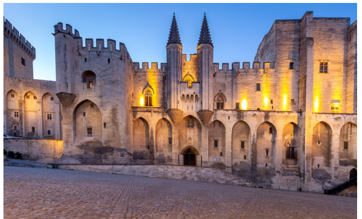
Palais des Papes in Avignon, France