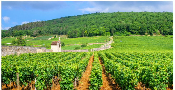
Vineyards of Burgundy