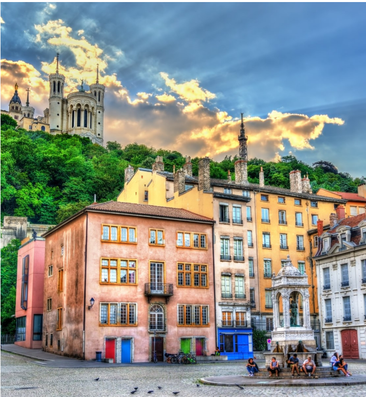
Basilica Notre Dame de Fourviere in Lyon

Our journey draws to a close as we transfer to the airport and catch our flight(s) bound for Canada and home. B