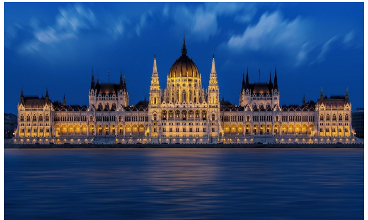
Illuminated Parliament Buildings from the water, Budapest