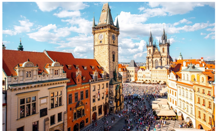
Stroll through Prague's vibrant Old Town