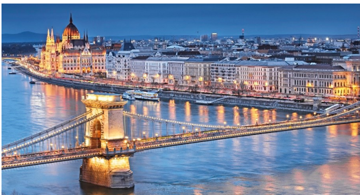
The Széchenyi Chain Bridge is one of the most iconic symbols of Budapest

Book by November 29, 2024 and save $200 per person