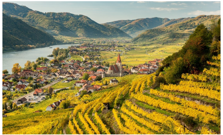
Savour world-famous wines

MAY 1, Thursday VIENNA During our morning city tour of Vienna, you will have the opportunity to see the impressive Vienna Opera House, the