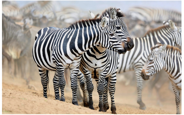
Zebras in Masai Mara

Sweetwaters Luxury Tented Camp (2 nights) BLD