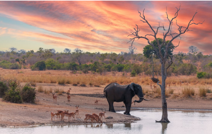
Serene African vistas

CT Rating 3.5/5 - Challenging: While we will be staying in superior lodges and hotels throughout this journey, members should be aware that travel in Africa is often over very rough dusty roads, in small 4x4 vehicles with difficult access. Members will require immunization against yellow fever and should take precautions against malaria. A yellow fever certification may be required to enter Tanzania. The itinerary may be affected by local conditions and late adjustments may be required. All participants must be in good physical condition to fully enjoy this adventure.