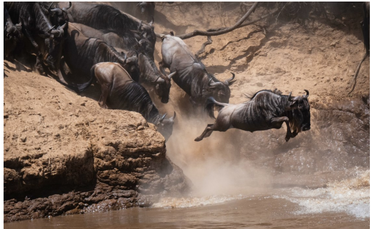
Wildebeest crossing the Mara River during the great migration