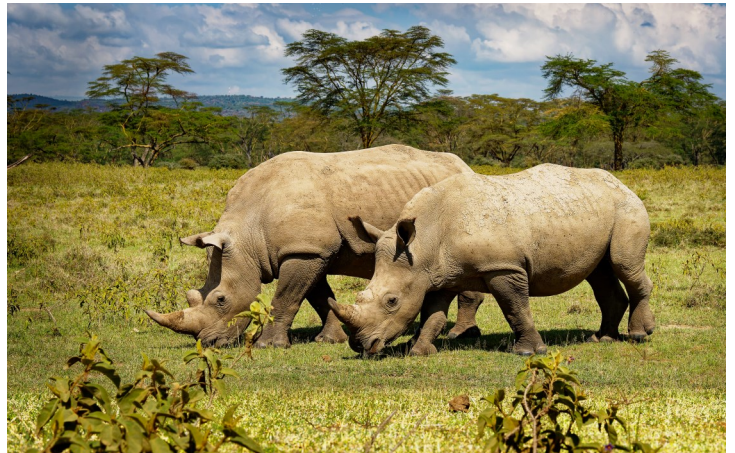
Rhinos in Lake Nakuru National Park

Enjoy a thrilling full day of game viewing, commencing with an early morning drive when the light is optimal and wildlife is exceptionally active. Our route will trace the Ewaso Nyiro River, a renowned habitat teeming with game, drawn to the area's dry plains despite the ever-present predators. A standout feature of our stay awaits at the Sweetwaters Chimpanzee Sanctuary, a unique haven established through collaboration between the OI Pejeta Conservancy, the Kenya Wildlife Service (KWS), and the Jane Goodall Institute. Nestled within the riverine forest and savannah grassland, this sanctuary is home to 26 orphaned chimps, promising an unforgettable highlight of your journey. BLD