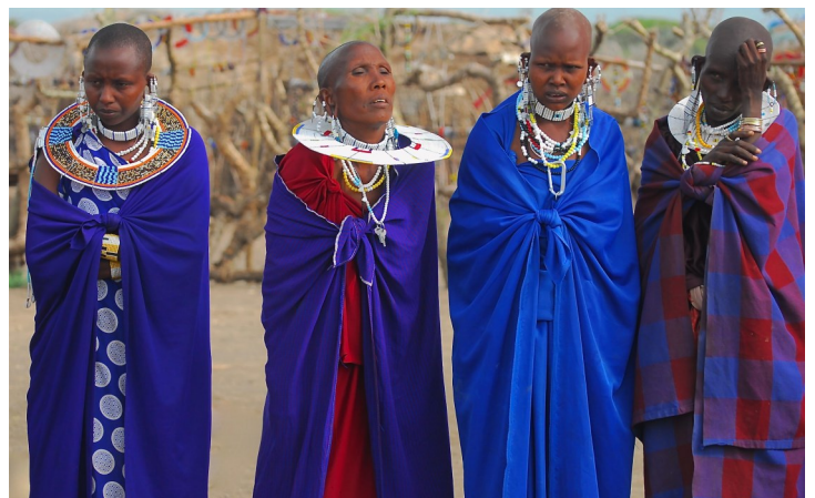
Maasai women adorned in vibrant, colorful garments

Explore the park's abundance of game, blessed with permanent water. At this time of year, you may witness vast herds of zebra and wildebeest, along with the predators that follow them. Usually, these herds arrive to feast on fresh grass and give birth to their young. Optional hot air balloon rides (at an additional cost) offer a unique perspective. BLD