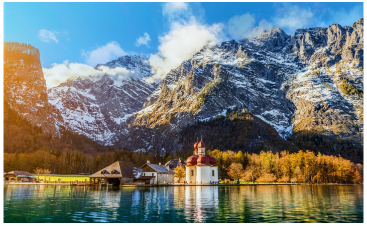
Clear waters of Lake Koningsee