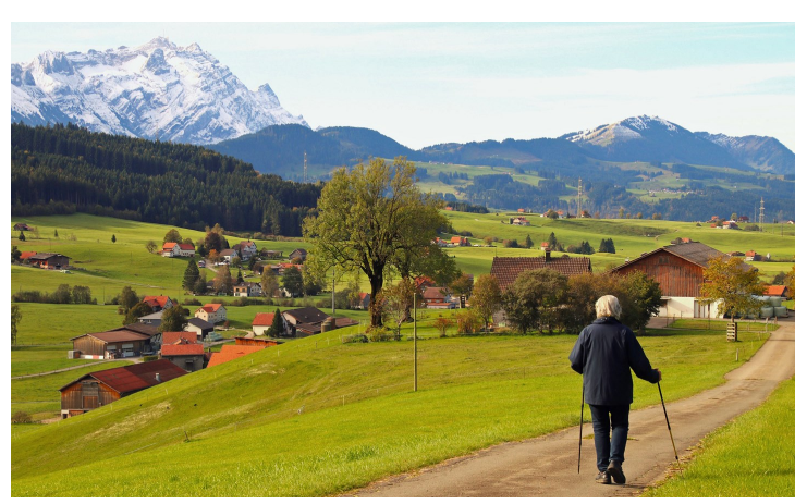
Bask in the beauty of the Austrian Alps

Our hike this morning brings us along the Ammer River north to Unterammergau. We walk through the Pulvermoos nature reserve. On a slight incline, we walk along Romanshöhe to Christuskreuz, which offers a magnificent view over the Ammer Valley. We stop at the mountain lodge Romanshöhe for lunch. In the afternoon continue along Gregorichapel back to Oberammergau. (11 km, 4 hours, easy hike, 143 m elevation change)