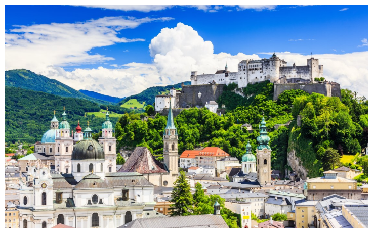
Discover the timeless charm of Salzburg