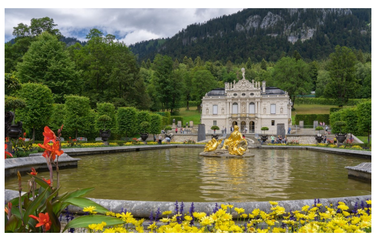
Discover the elegant Linderhof Palace