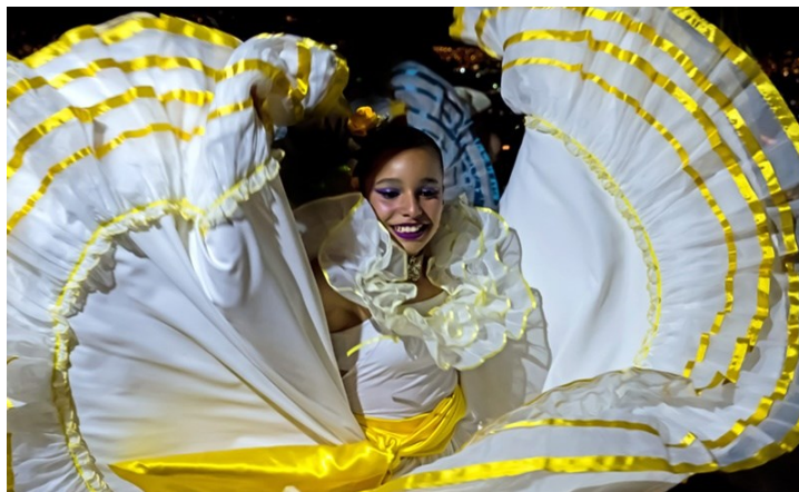
Traditional costume and dance of Costa Rica.