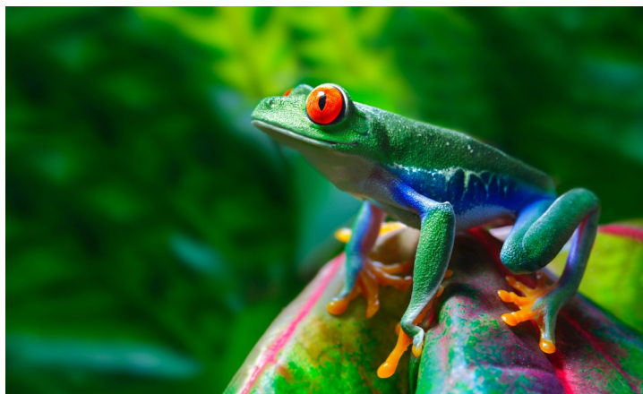
Costa Rica's Red-eye tree frog