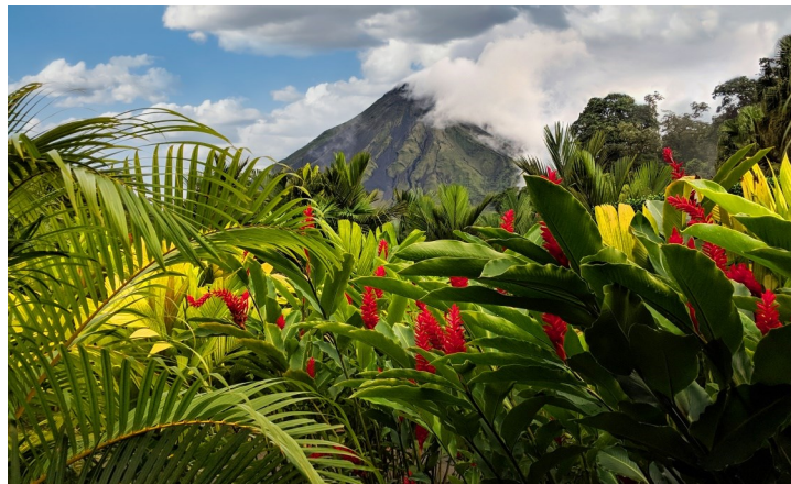
The magnificent Arenal Volcano