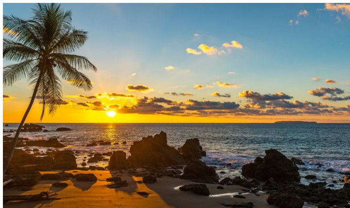
A stunning sunset in Tamarindo Beach

All too soon our unforgettable Costa Rican adventure comes to a close as we transfer to the airport for our journey back to Canada. B