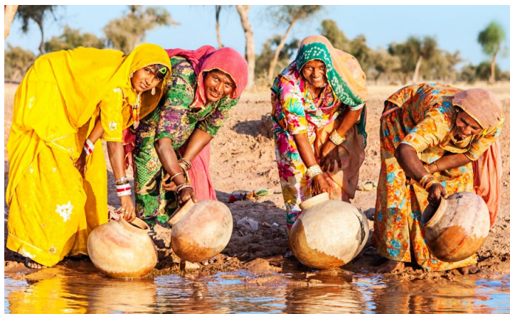
Experience the way of life of the Thar Desert

FEB 11, Tuesday DESERT FESTIVAL Experience the rustic allure of Rajasthan's villages with visits to Kuldhara and Khaba. An unforgettable evening at the colourful Desert Festival awaits. Cheer on camels as they race to victory and witness the thrilling Dhora Dhor (Ox Cart) races. End the night with an electrifying showcase of folk music, dance, and fireworks. BLD