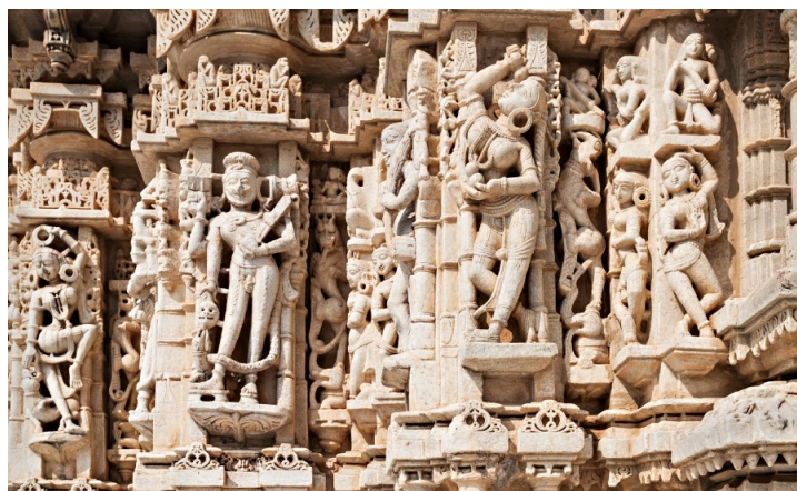
The intricately hand-carved marble pillars of Ranakpur Temple

FEB 14, Friday JODHPUR Marvel at Mehrangarh Fort's grandeur, adorned with intricate lattice balconies and mirrored walls, offering panoramic views of Jodhpur. Explore the Jodhpur Museum and Jaswant Thada. Drive past the Clock Tower and Sardar Market, famous for spices. Indulge in Rajasthani cuisine at Khas Bagh, a Victorian-style hotel showcasing Raj Period memorabilia and vintage cars. BLD