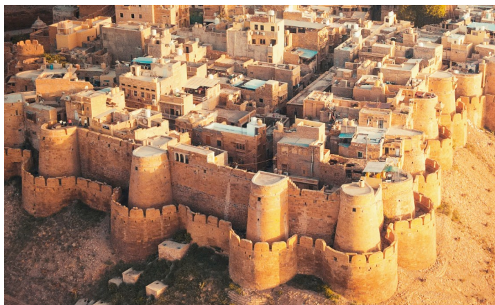
The impressive Golden Fort of Jaisalmer

FEB 9, Sunday DELHI / JAISALMER Fly to Jaisalmer, a historic fortress city nestled in the Thar Desert. The majestic Golden Fort, built in the 12th century, has towering yellow sandstone walls that have stood as a bastion against invaders for centuries. Discover Lodurva village, once the vibrant capital of the Bhatti Rajputs, renowned for its Jain temples intricately carved from golden sandstone. Rang Mahal (3 nights) BLD