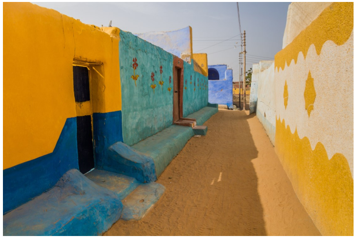
Visit a Nubian Village