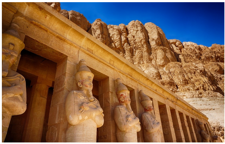
Temple of Hatshepsut