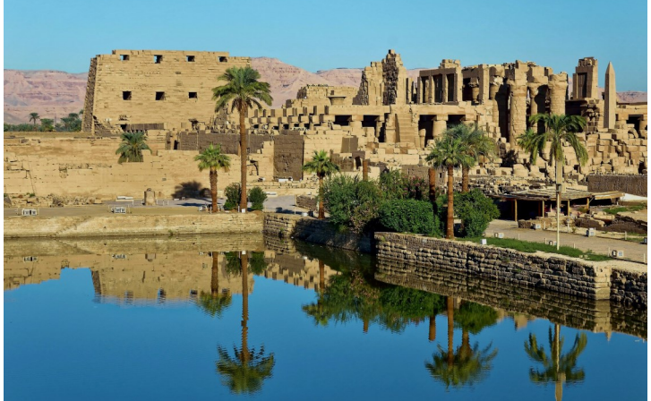
Marvel at the columns at Karnak Temple

After a short flight to Cairo, we proceed to EL Moez Street and walk through old Cairo to experience the best Islamic medieval treasures, including traditional schools, mosques,