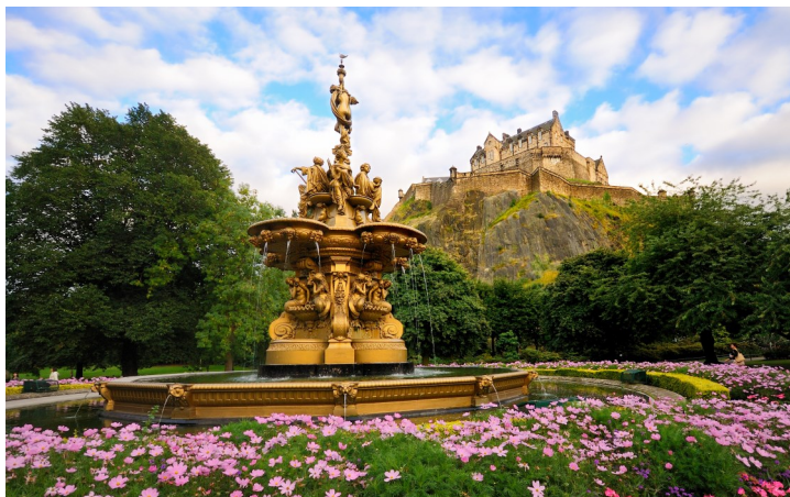
Views of the beautiful Edinburgh Castle

CT Rating 4.5 / 5 - Extremely Challenging: This journey involves hikes on hilly, uneven surfaces, a relatively fast-paced itinerary with a good deal of coach travel and visits to some remote parts of Scotland. Hiking distances, elevation change, and times listed are estimated and refer to the total time spent hiking throughout a full day. Travellers must be in excellent physical condition and able to maintain the group pace. Depending on weather and location conditions, daily activities may have to be altered or adjusted. Accommodations will be in comfortable traditional Scottish hotels with atmosphere and character. Trail conditions may vary and are subject to change. Porters may not be available at all hotels and members should be prepared to move their own luggage when required.