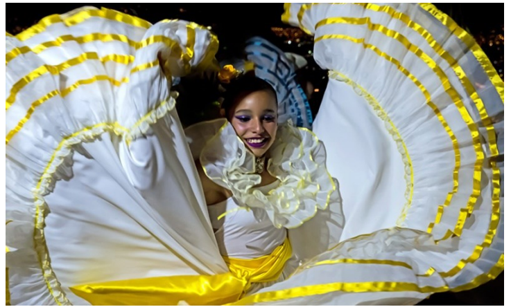
Traditional costume and dance of Costa Rica.