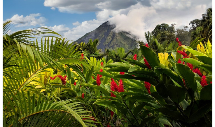
The magnificent Arenal Volcano