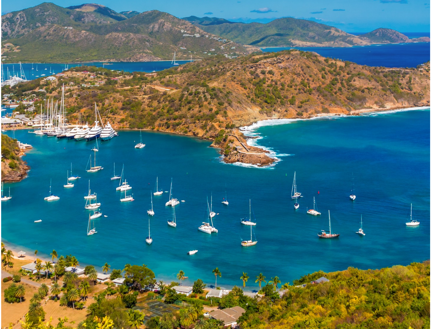
Explore the historic English Harbour in Antigua