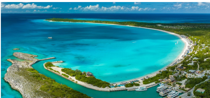
The pristine and private Half Moon Cay island.

CT Rating 1/5 - Leisurely: This cruise is suitable for all passengers who meet our basic criteria for group travel.