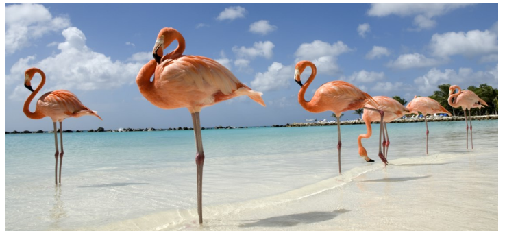
Flamingos in Oranjestad, Aruba. Courtesy of Holland America Line