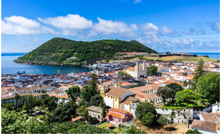
The quaint town of Horta, Faial Island