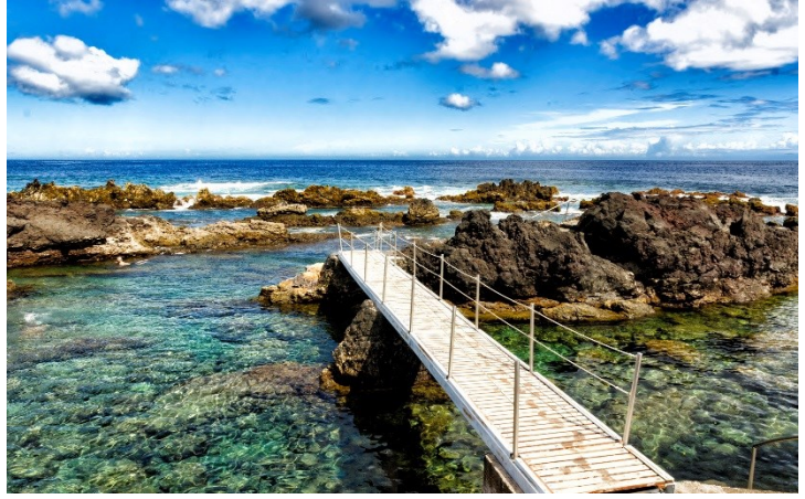
The natural pools of Biscoitos on Terceira Island

SEP 18, Wednesday FAIAL / SÃO MIGUEL ISLAND After a relaxed beginning to the day, we take flight to São Miguel, the largest and most geographically diverse of the islands. Following lunch, our exploration begins on foot along Marginal Avenue. We pass the iconic "Portas da Cidade" (City Gates) before continuing to the city hall, past the gleaming statue of St. Michael Archangel, the island's