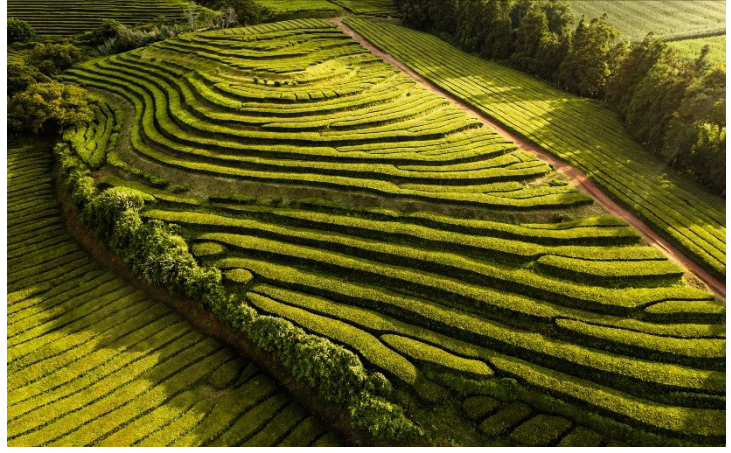
Rolling hills of lush, verdant tea bushes blanket the landscape on São Miguel