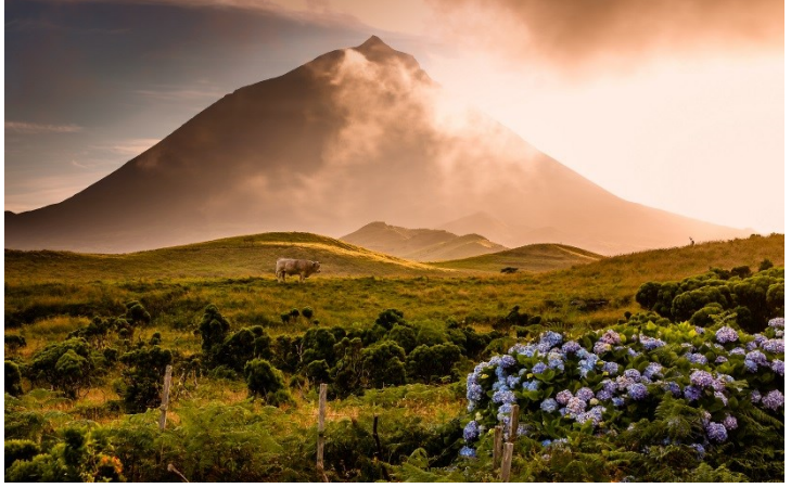
Mount Pico, the highest peak in the Azores