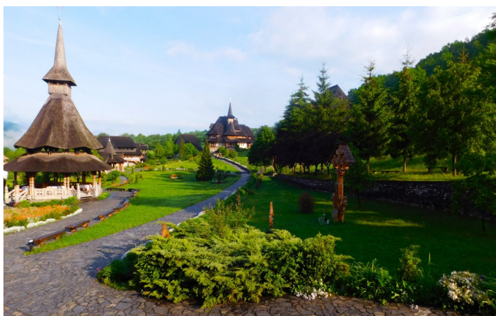
The Orthodox Barsana Monastery