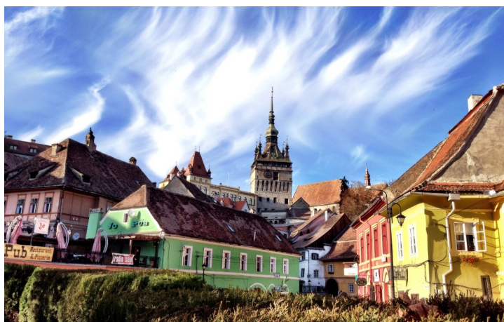
Medieval town of Sighisoara