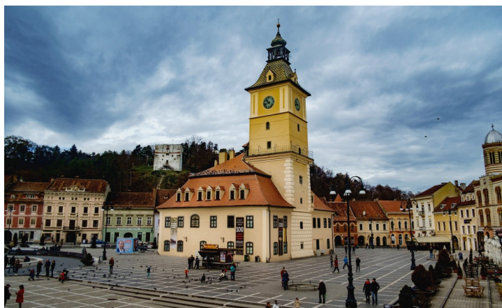
The Council Square in Braşov