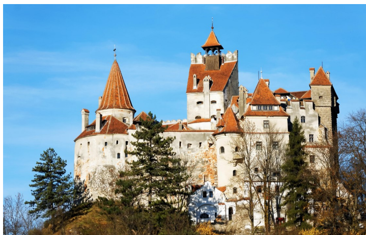
Explore Bran Castle, home of the fictional Dracula

Hotel Dukat Gura Humorului (2 nights) BD